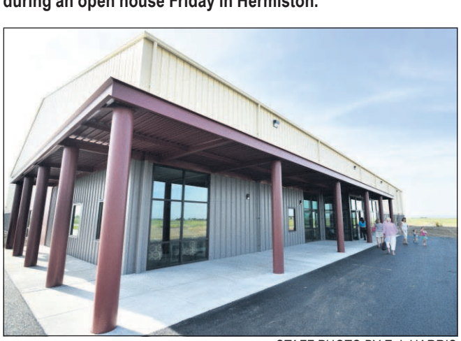
Visitors to the Eastern Oregon Trade and Event Center both coming and going during an open house Friday in Hermiston.

ond option would involve switching the property from the Stanfield Irrigation District to the Hermiston Irrigation District and using some of their water.