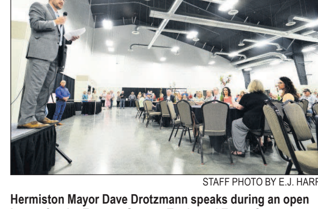
house for the Eastern Oregon Trade and Event Center on Friday in Hermiston.

facility rentals while also adding up costs, questions about EOTEC's operations budget continue to be mostly answered with: "We don't know yet."