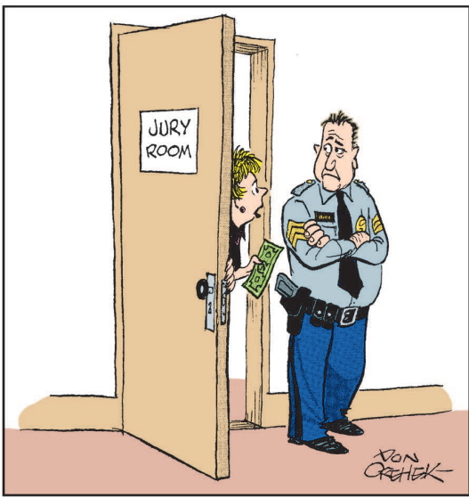
"Can you change a dollar? We need to flip a coin."