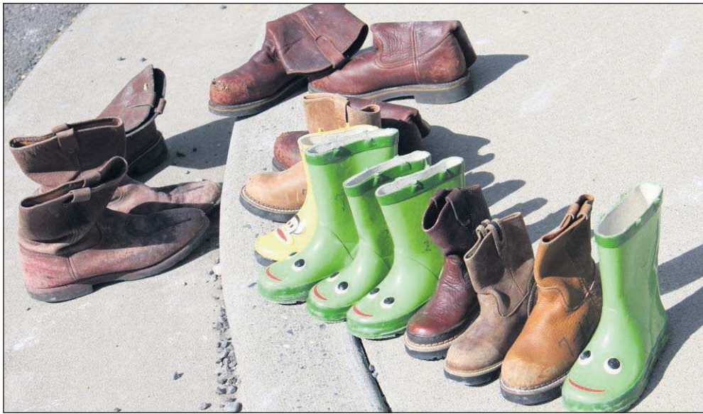
Wellington boots were the material of choice during the Welly Toss.

The Wee Bit O'Ireland Festival continued Sunday with vendors, sheep dog trials, and "Road Bowling" at Balm Fork Road.