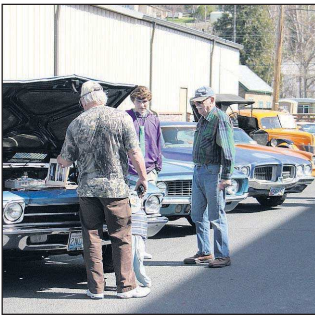
Visitors take in classic cars during the "Cruz-In" at Heppner's Wee Bit O'Ireland festival.