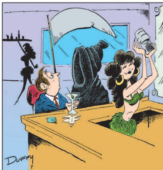
"Could we take this outside? I promised the wife I'd never be caught dead in a place like this."