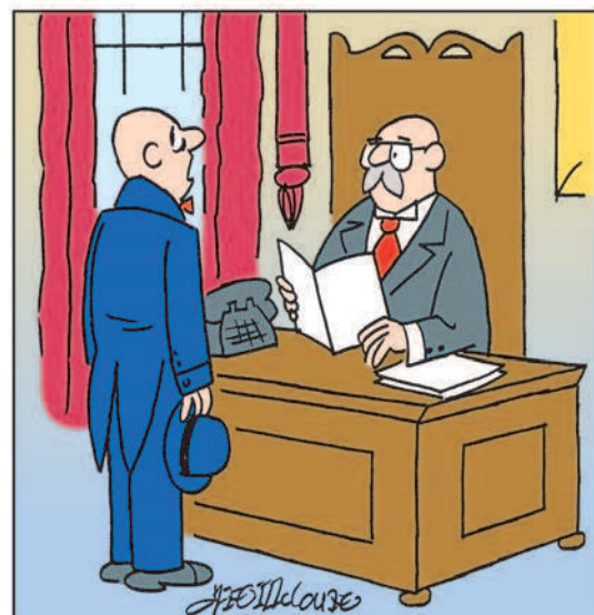
"I don't do windows and I refuse to be called 'Jeeves'."