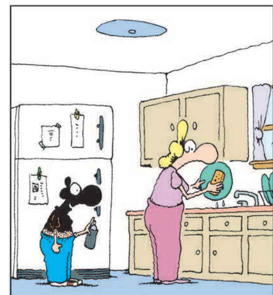
"I painted the old fan, Mom."