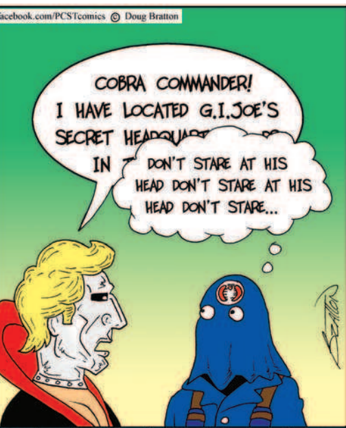
Despite what he had been told by the salesman, Destro's hair piece did not "look natural."