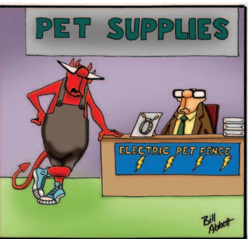
"What kind of deal can you give me on 7 or 8 trillion of those collars?"