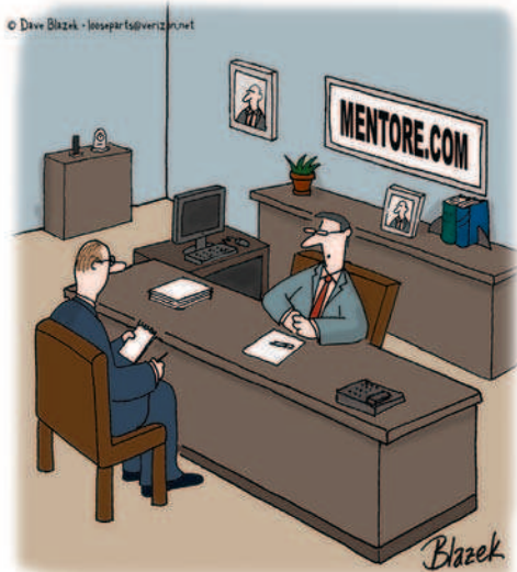
"Unfortunately, I started the company before I realized he didn't know how to spell."