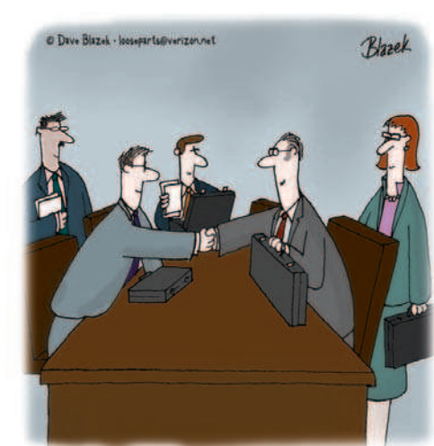
We can all walk away from this deal feeling great. Provided we go directly home and boil ourselves.