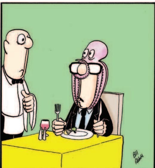
"Would you mind cooking my calamari a bit longer?"