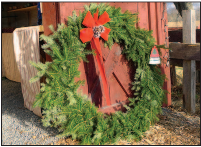
by Metro Creative Connection

Christmas decorations can range from grandiose lighting displays to more subtle adornments. Some families may prefer more traditional holiday decor, while others might like the look of modern trimmings.