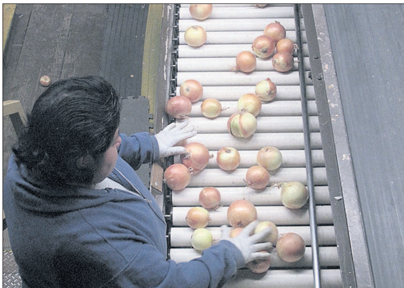
Yellow onions grown in the Treasure Valley area of Idaho and Oregon are sorted at the JC Watson Co. packing facility in Parma, Idaho, Sept. 15. Growers say they can live with the water quality provisions included in the FDA's final produce safety rule, which was released Nov. 13.

The bulb onions grown in this region are left in the field to dry for a few weeks following harvest. Field trials by Oregon State University researchers have shown these onions will meet the so-called die-off provisions.