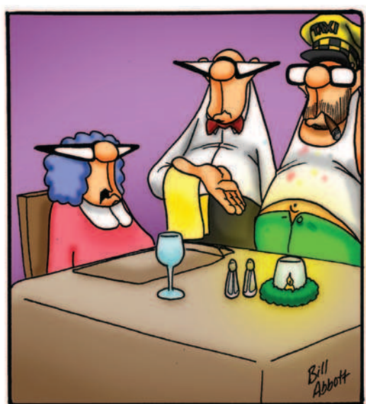
"By 'cab', I meant cabernet."