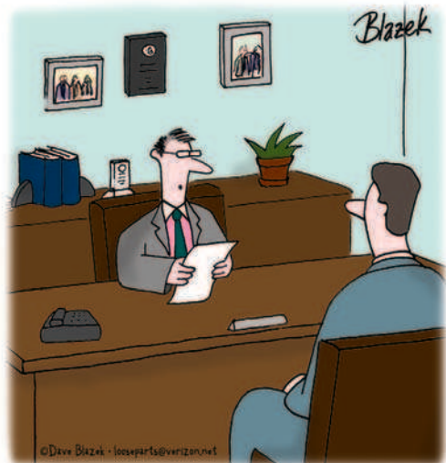
"I see your resume says you have excellent penmanship. Wonderful. What exactly is that?"