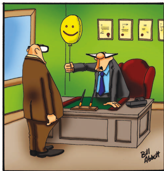
“Take it. It's your bonus.”