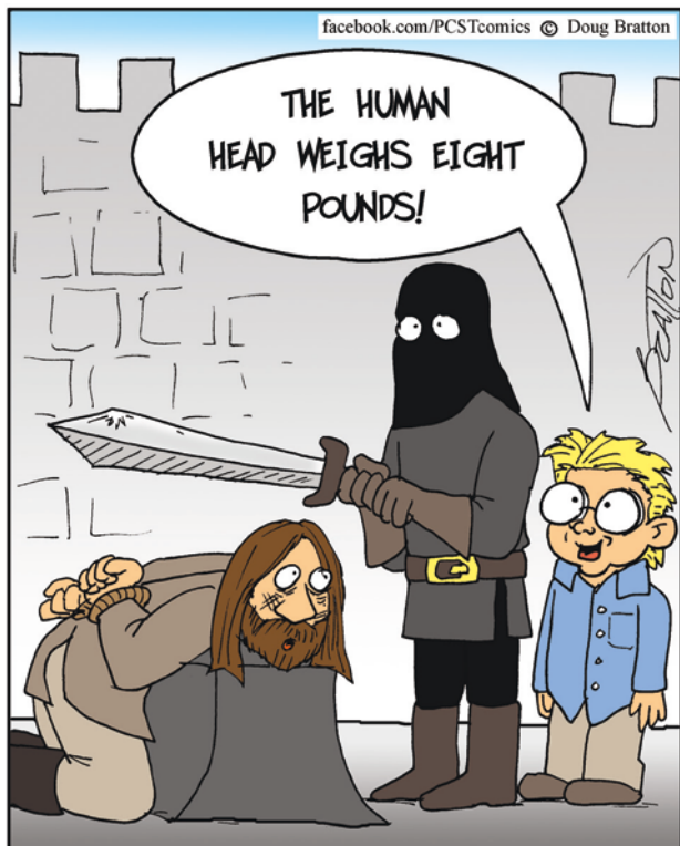
Jonathan Lipnicki's Game of Thrones Cameo