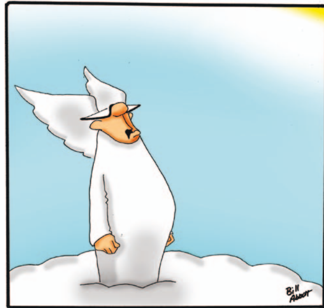
“I just saw my wife here, so I’d like some reassurance this is actually Heaven.”