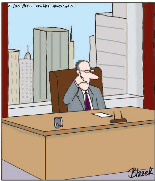
“Miss Timpkins, could you have someone come in and switch my finger with a phone?”