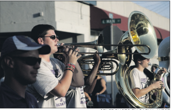
The Hermiston High School marching band performs Saturday, Aug. 8, 2015, in the Umatilla County Fair parade. The band placed first in the youth band category in the parade.