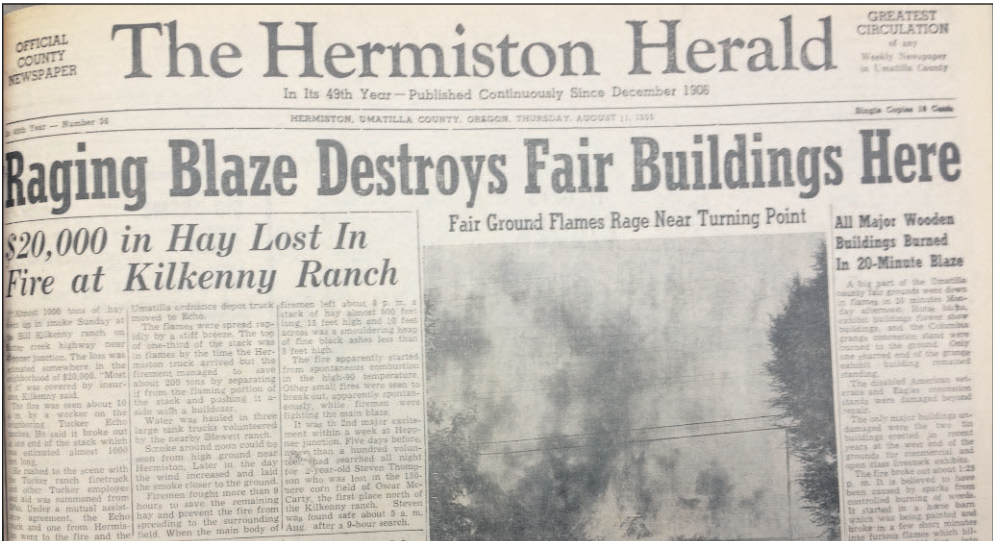
The front page of the Hermiston Herald on Aug. 11, 1955, reports that all the wooden buildings on the Umatilla County Fairgrounds were destroyed by fire, a little over a week before the fair was scheduled to start. With some borrowed temporary buildings from the Umatilla Ordnance Depot and a lot of volunteer labor, organizers were able to still hold the 1955 fair as scheduled.

But there were some snags. Commercial exhibi-