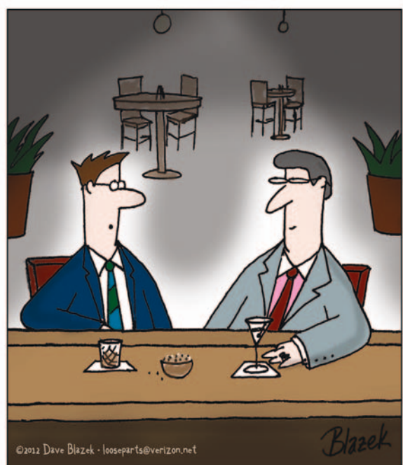
Really? You can package human souls and sell them as derivatives?