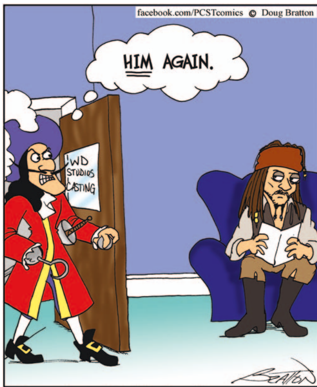
Things get uncomfortable when Disney needs a pirate.