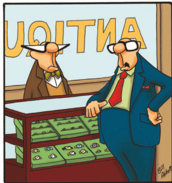
"I'm looking for a ring for my wife, preferably one with a curse on it."