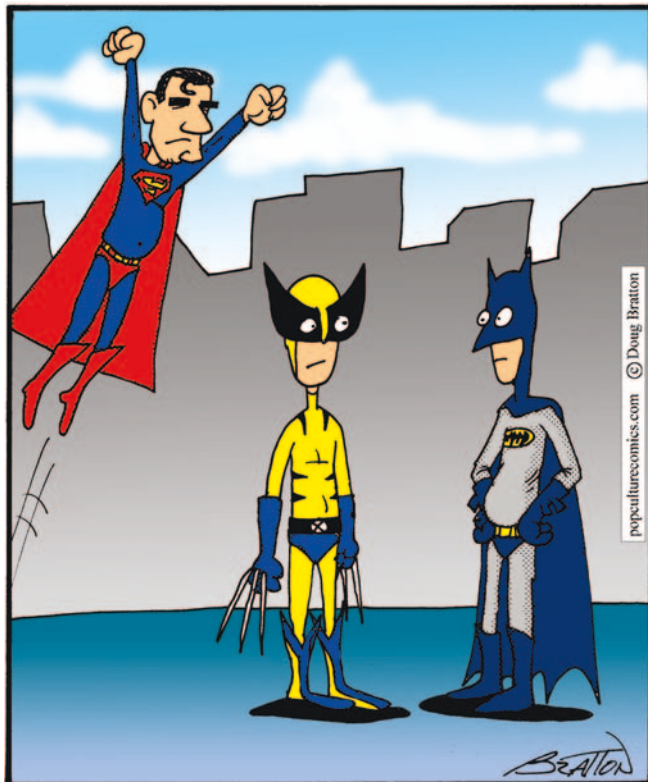
Superheroes, After the Crackdown on Steroids