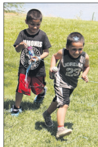
Children play with silly string at Umatilla Landing Days Saturday.

Umatilla Landing Days attendees peruse a variety of vendors at the event Saturday at the Umatilla Marina Park. The event continues until a fireworks display at 10 p.m. today, Saturday, June 27.