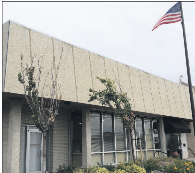
This is how the building looks today. The former bank building today is known as Hermiston City Hall.