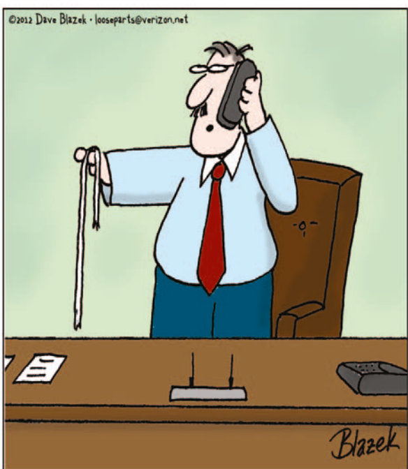
What? It's a tourniquet. It's a sling. It's a jumprope. It's floss. Tell the rank and file I think it's a pretty darn good health care package!