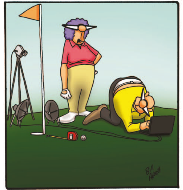
"This is still just a game to you, right?"