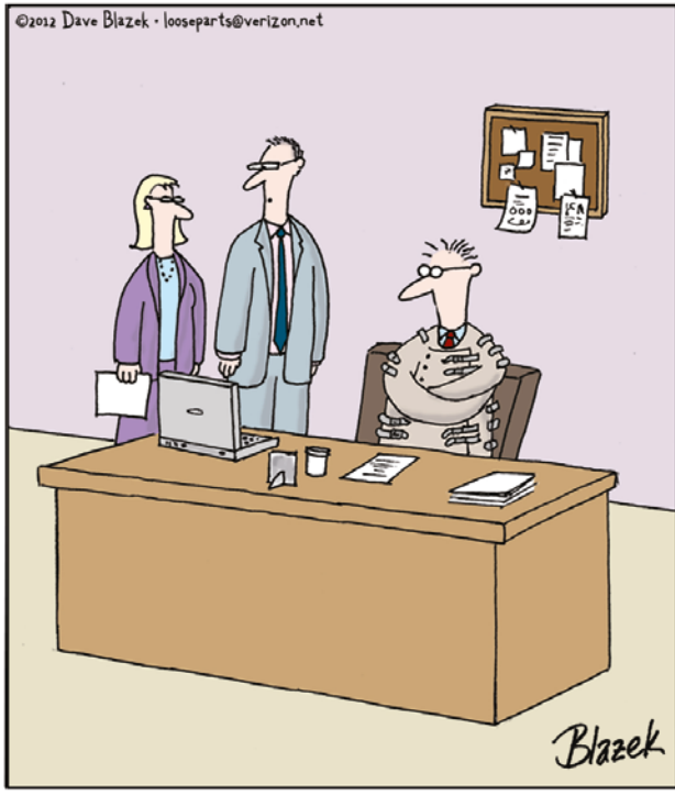
"I don't see how it's a dress code violation. It is a jacket and tie."