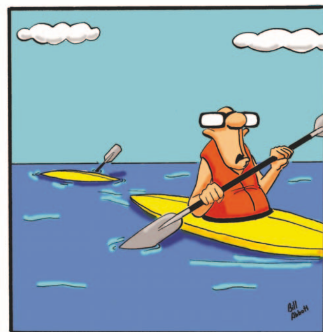
“Getting the hang of it?”