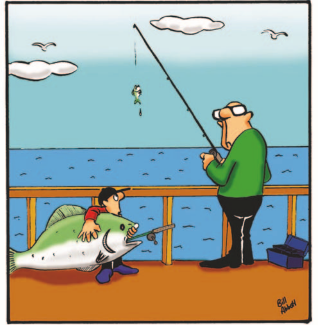
“Can you measure this one and see if it’s a keeper, Dad?”