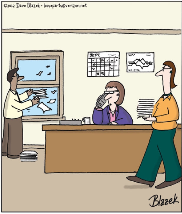
“Oh, I assure you, sir. Every resume passes right through this office.”