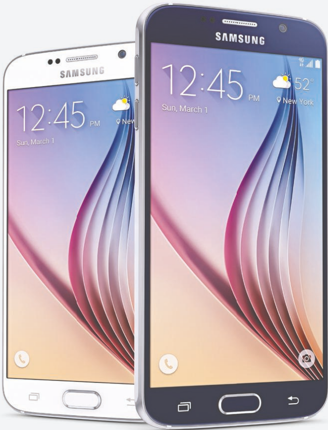
SAMSUNG Galaxy S6