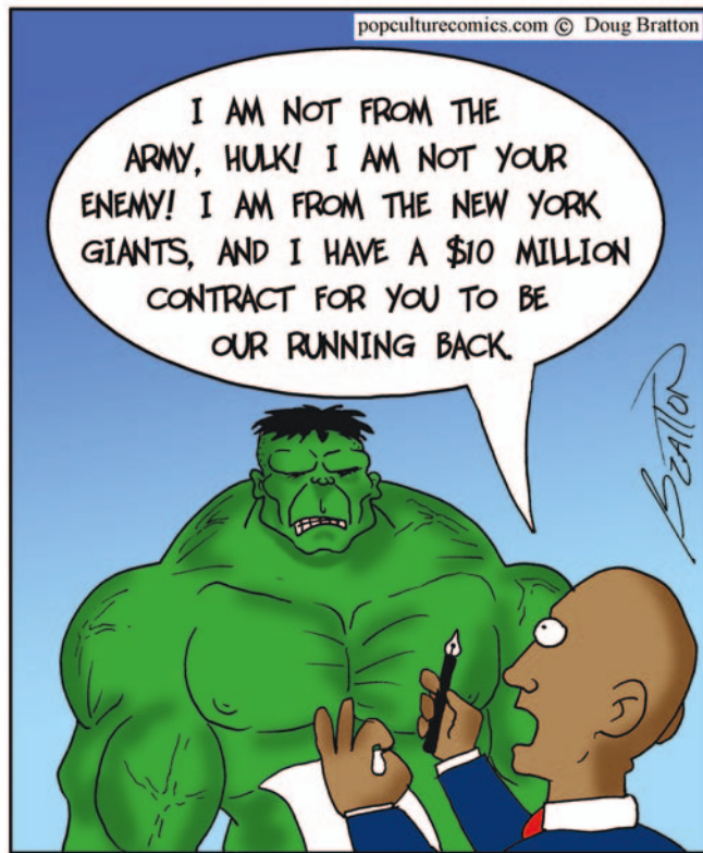
Best Free Agent Signing Ever