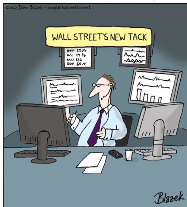
"That's right, sir. For just a small monthly fee, we promise not to handle any of your money."