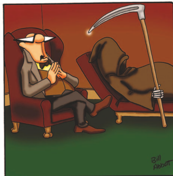
"Let's set aside the role as the 'Bringer of Death' and explore your desire to dance."