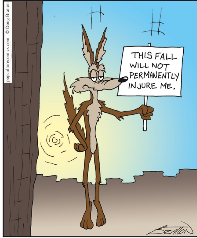
Wile E. Coyote finally gets it.