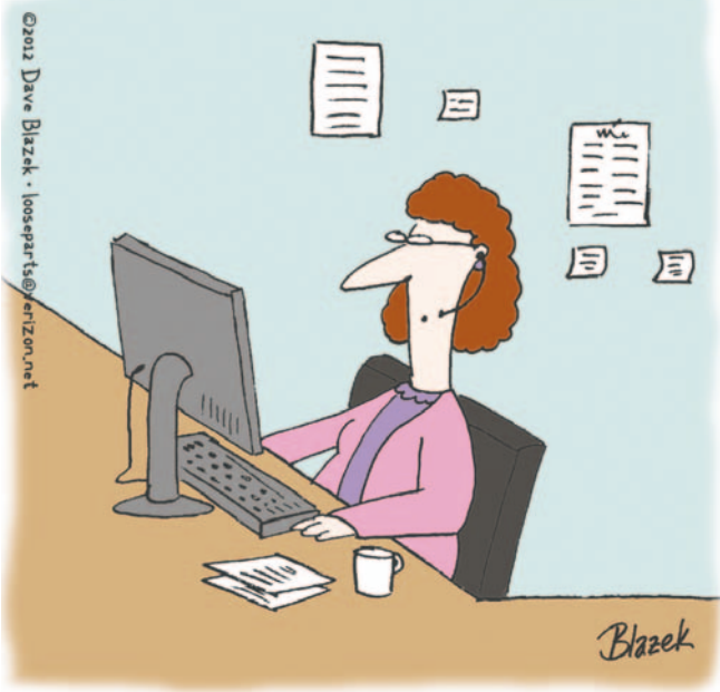
"Yes, m'am, that's the catalog price ... plus $3.95 for shipping and handling and $8.95 for lunching and screwing around."