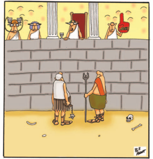
"No, we will not be starting with a safety brief today."