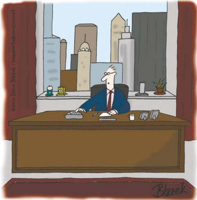
"Miss Fox, would you please send someone in to change the paradigm."