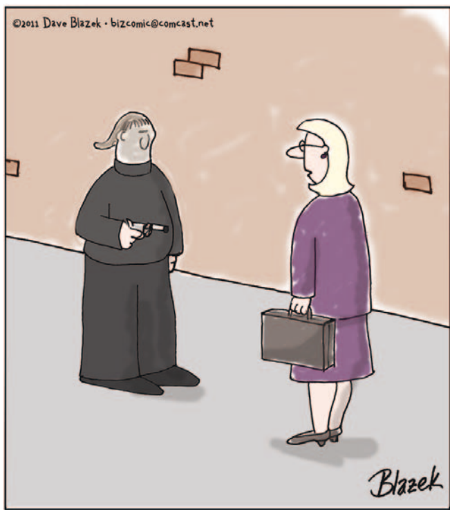
"Yeah, I have to wear pantyhose at work, too."