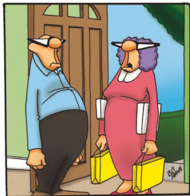
"I left your credit card outside. It's still smoking."