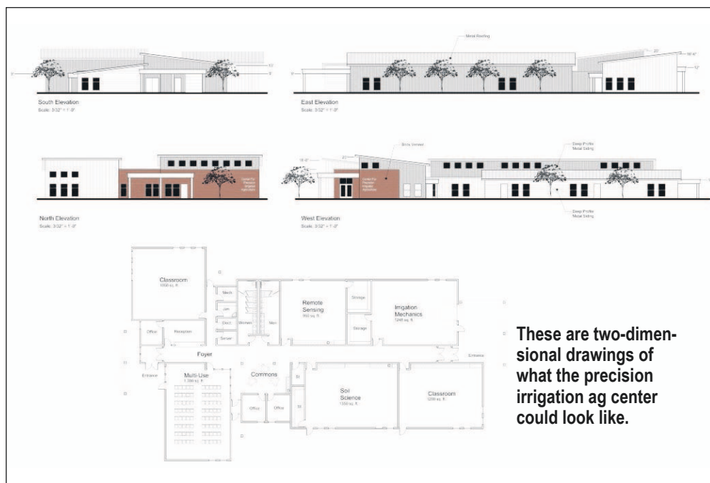
These are two-dimensional drawings of what the precision irrigation ag center could look like.