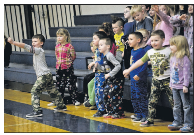
Cat in the Hat made a special guest appearance during the Stanfield Elementary School assembly celebrating Read Across America Week Thursday afternoon.