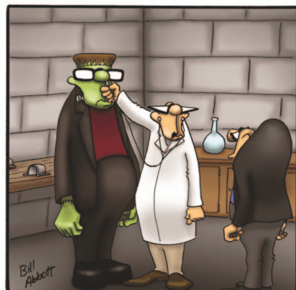
“...so I said, ‘what the heck’, and installed an mp3 player too.”