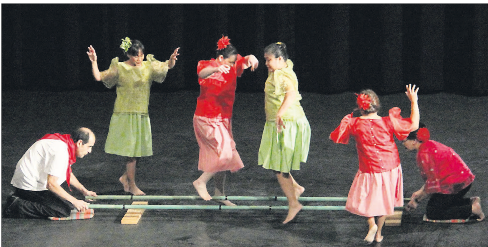
The Filipino American Community Dancers perform 'Tinikling,' which won second place at the Hermiston High School swim team's annual talent show Saturday.