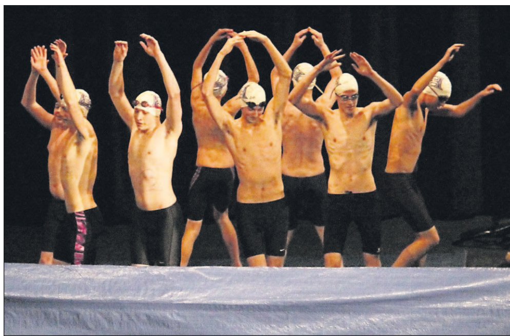
Members of the Hermiston High School boys swim team perform a synchronized dance at the team's annual talent show Saturday.

"Overall, I think it was a hit," she said. "We had three more acts than we did last year, and we got done in less time. I think there were more people here than last year. We gave back to the community, and the community helped us, so it was a win-win. So now we book the auditorium and start planning for next year."