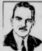
THOMAS E. DEWEY