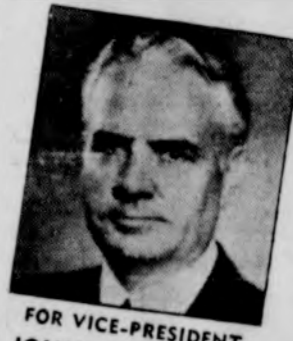
FOR VICE-PRESIDENT JOHN W. BRICKER