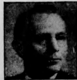
For U. S. Senator GUY CORDON