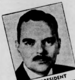
FOR PRESIDENT THOMAS E. DEWEY

This List OF REPUBLICAN CANDIDATES IS PUBLISHED FOR YOUR CONVENIENCE— SAVE FOR REFERENCE NOV. 7