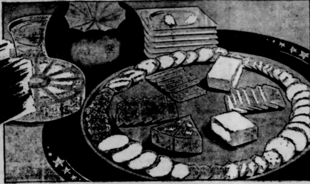
A Varied Selection of Nearly All Kinds of Fine Quality