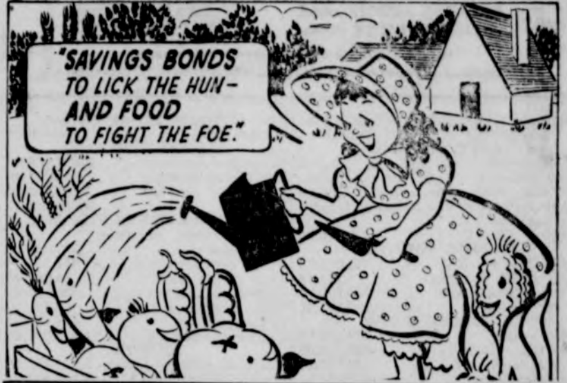
Careful Picking Prolongs Crops

When picking peas or beans, take care not to break off or pull up the vines. Hold onto the vines with one hand while breaking off pods with the other. Well handled, they will go on producing for a longer time than when roughly treated. The same is true of peppers, eggplant, and tomatoes. If the plants are uninjured, young fruits coming on will grow better and ripen properly. Begin to pick and use young summer squash as soon as they are a few inches in size. Keep the fruits picked, and the vines will yield more abundantly than if the first ones are left to grow to full size.