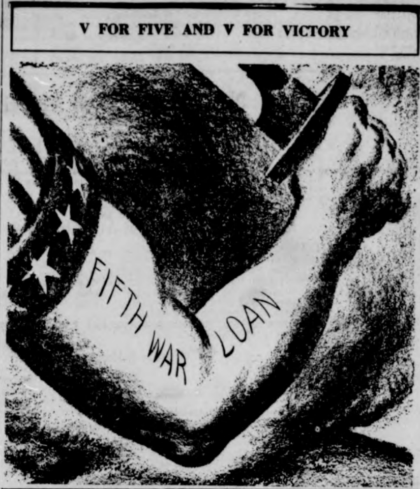
V FOR FIVE AND V FOR VICTORY

Meat is absent from the diet of three-fourths of India's population, largely because of religious prohibitions.