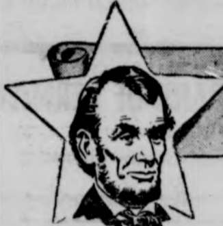
ABRAHAM LINCOLN Born February 12, 1809 16th President of the U. S.

"... with firmness in the right, as God gives us the right, let us strive on to finish the work we are in..." Let Lincoln's immortal words remind you to save every penny, every dime, every dollar to invest in EXTRA War Bonds. Stone's can help you save... for there's a saving on everything you buy in a Stone's Store. Stone's greater variety, Stone's low prices, all the talk of the town. No one sells more—for less."