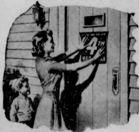
Every patriotic American will want to display this emblem at home—on his front door or in his window. It is the red, white and blue sticker that says you have done your part in the 4th War Loan.