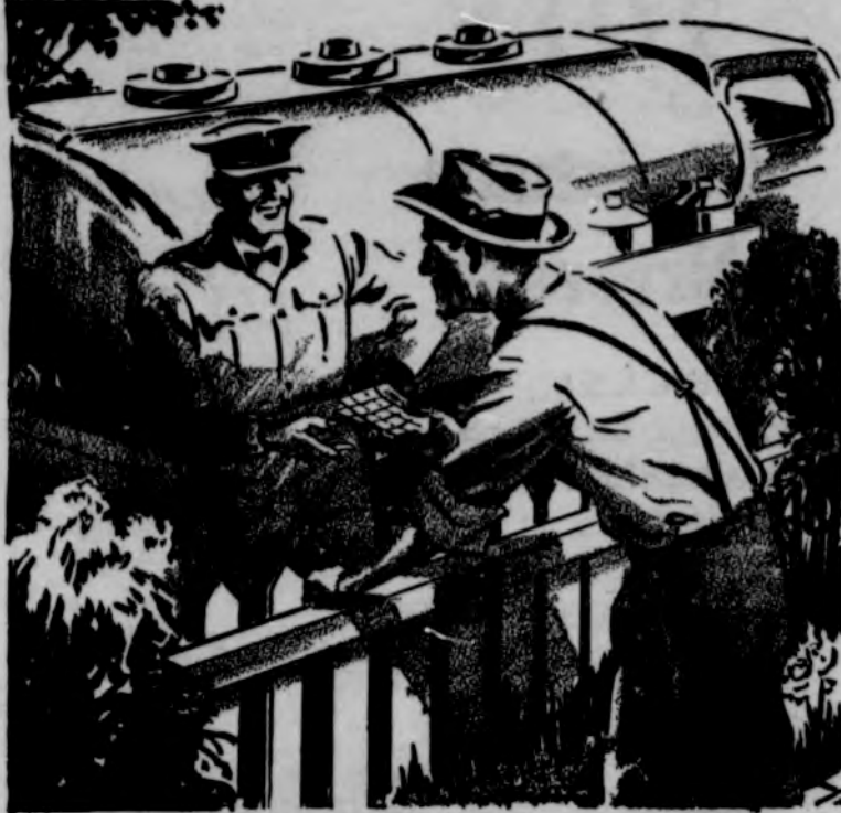
DON'T WASTE TANK TRUCKS —The ODT is asking farmers and businessmen to help reduce tank truck trips and mileage by placing larger fuel orders and calling for fewer deliveries.