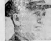
George C. Marshall

Washington, D. C.—How important is the average worker's war bond purchases out of his pay every payday in the grand strategy of the Allied High Command? Does the extent of his, or her War Bond allotment have a part in determining when, where and the strength of our military blows?