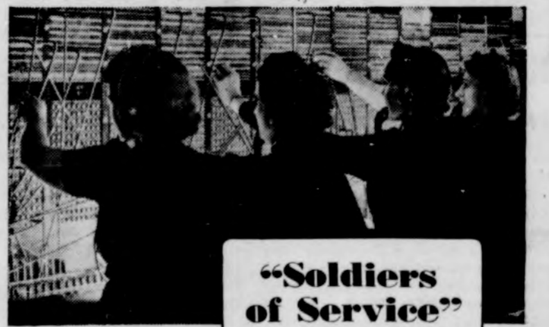
"Soldiers of Service"

About three-fourths of all sports equipment now being manufactured goes to members of the armed services and to those receiving pre-induction military training.