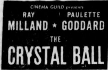
Color Cartoon—News Reel