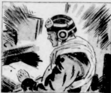
2. Radio combines the voice and the ears of the plane, allowing communication between the pilot and his squadron, and the ground and sea forces.