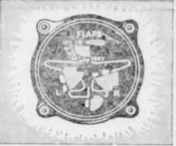
3. Instruments are the sensitive brain that relays messages to the pilot from all parts of the ship and helps him to control the plane in its flight.