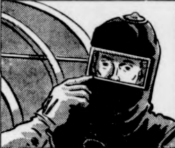
3. Frankenstein? No, just another G-E worker. His job is sandblasting big turbine castings for Uncle Sam's ships at one of the General Electric plants.