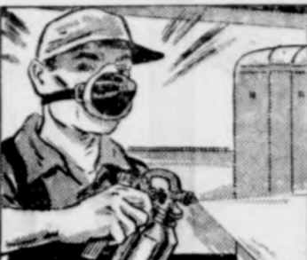
1. Not a gas mask, but a special nose mask to guard his breathing, is worn by this spray painter at his job in one of the General Electric plants.

America's "soldiers of production," men and women working in the plants of American industry, have their uniforms, too. Some uniforms worn by G-E workers on vital production jobs are shown below.