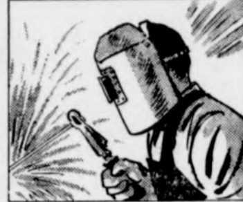
4. The helmet he wears is to protect him from light! The rays from a welder's arc could cause blindness if he did not wear this strange headgear.

General Electric believes that its first duty as a good citizen is to be a good soldier.