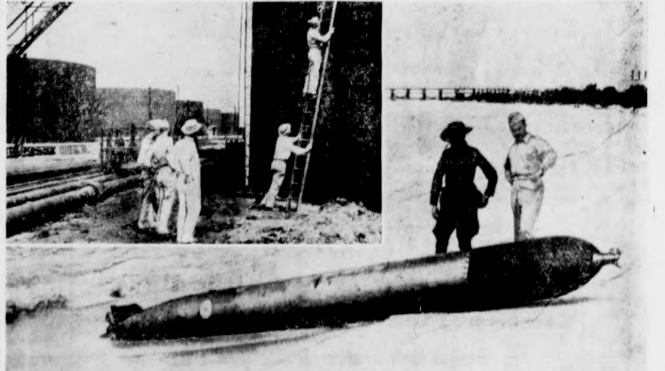
Above you see a torpedo fired by an Axis sub off the island of Aruba. It missed its target and ran aground. Later the 18-foot missile exploded, killing four Dutchmen who were attempting to dismantle it. Inset: Lieut. Col. William Ratten, of the U. S. army, climbs a ladder to inspect a 4 by 6-inch dent in an oil tank on the island of Aruba following the torpedo and shelling attack of Axis subs.