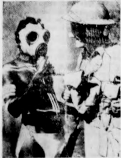
This photo, made in Australian territory, shows a native being introduced to that blessing of modern civilization, the gas mask. The warrior seemed quite pleased with it.