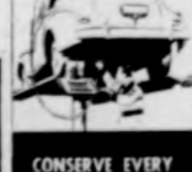
CONSERVE EVERY VITAL PART