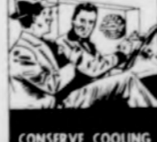
CONSERVE COOLING SYSTEM