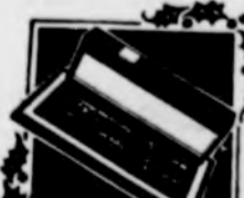
Waterman & Eversharp Pen & Pencil Sets