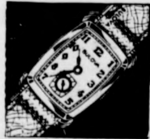
SENATOR 17 jewels . . . .