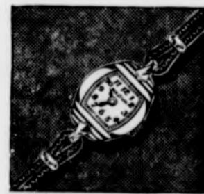
GODDESS OF TIME "A" 17 jewels . . . .