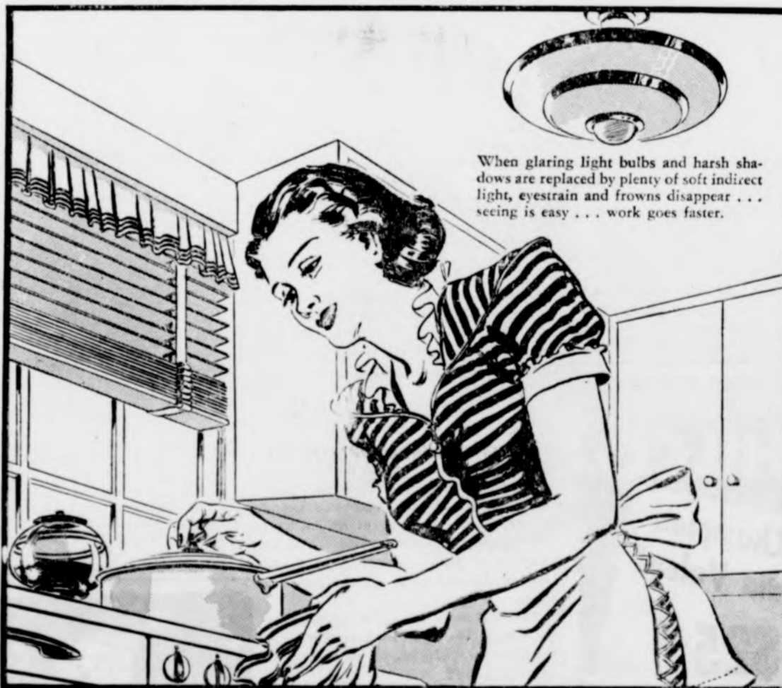
When glaring light bulbs and harsh shadows are replaced by plenty of soft indirect light, eyestrain and frowns disappear... seeing is easy... work goes faster.