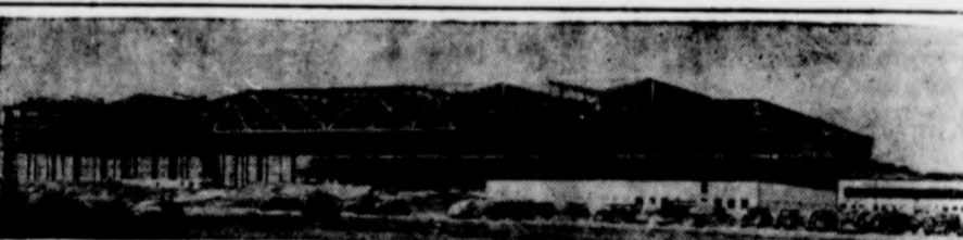
Chrysler Tank Arsenal at Detroit, for which erection of steel was commenced on November 20th, 1940, is now in operation.