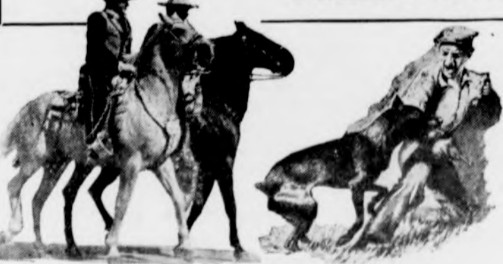
Above illustration shows members of San Francisco Mounted Posse also "Canine Police" going through their paces.